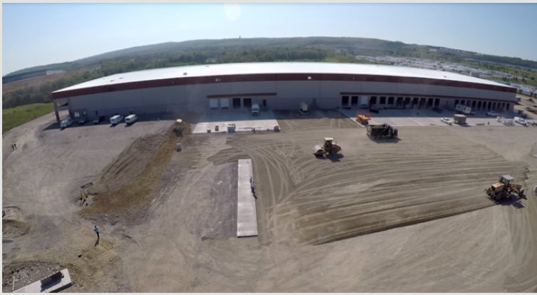
Front view of loading area under construction