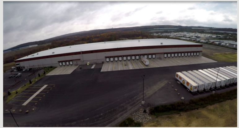
Front view of completed loading area