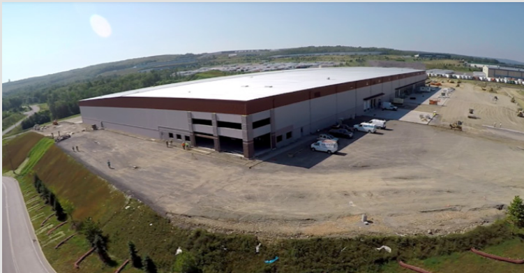
Front view of building under construction