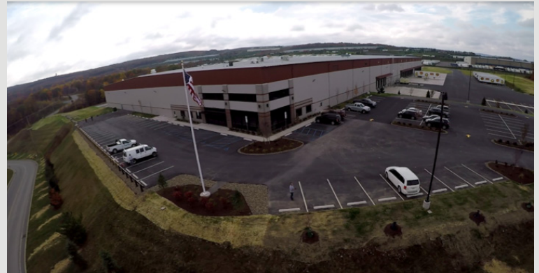
Front view of completed building