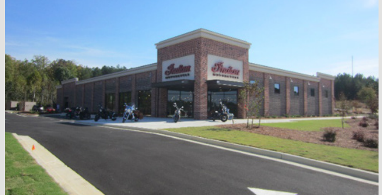
Front view of completed building