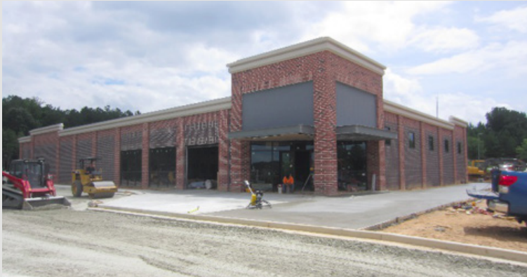
Front view of building under construction